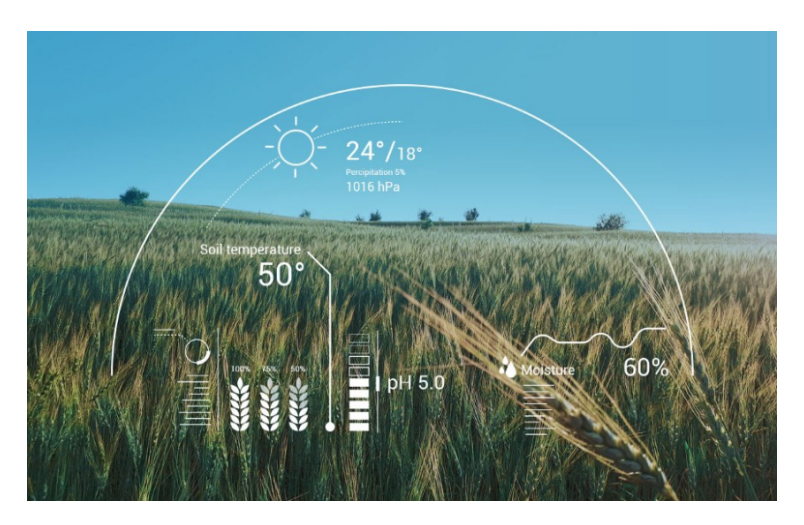
Figure 3: Empowering the future of farming with AI-powered forecasting capabilities for improved crop management, efficiency and yield management.

Smart Agriculture Agriculture is perhaps one of the sectors most directly impacted by the vagaries of weather, with climate conditions significantly affecting crop yields, pest infestations, and harvesting times. The integration of ML in weather forecasting offers a boon for smart agriculture, where data-driven decisions can lead to optimized crop management strategies. Access to precise, near-term weather information allows farmers to make informed decisions about irrigation, thus conserving water resources. It can also inform the timing of planting and harvesting, maximizing yield and reducing the risk of crop loss due to unexpected weather events. Furthermore, predictive models can help in managing the application of fertilizers and pesticides, ensuring they are applied at the most effective times, which not only increases crop yield but also minimizes environmental impact.